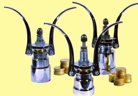
Hand Operated Screw Cap Closure (for pre threaded caps)