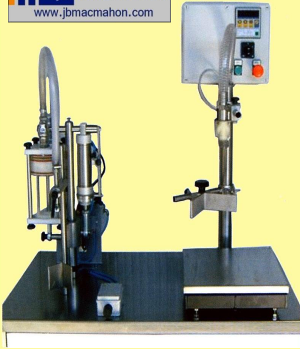
Bottle and Container Filling: Model Combi-Oil